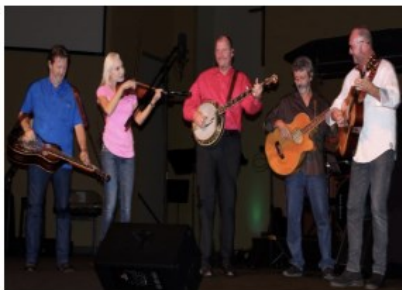
The Farm Hands