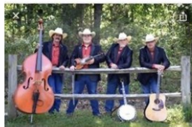
The Finely River Boys